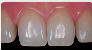
Patient with diastema - initial situation.