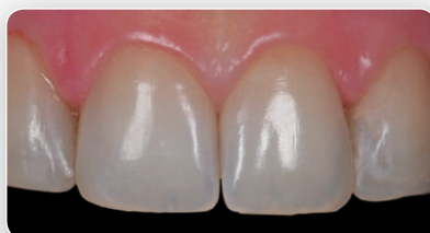
Diastema closure with OliREVO, tooth 12,11 and 21, 22..